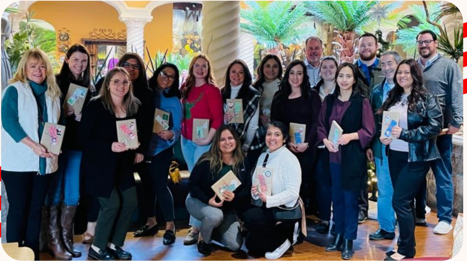
PASPB Board of Directors, Committee Chairs, and past presidents